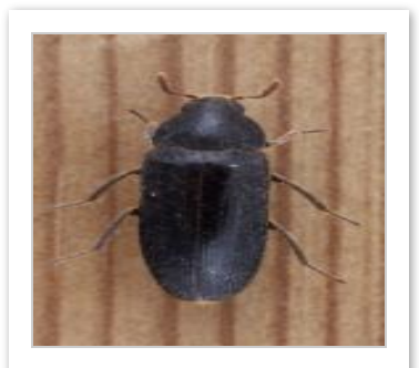
Peruvian Hide beetle Dermestes peruvianus