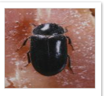
Hide or leather beetle Dermestes maculatus