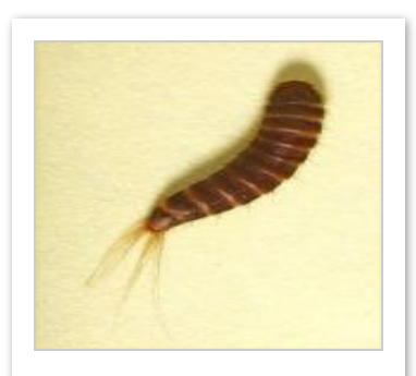
Two spot carpet beetle Attagenus pellio larva