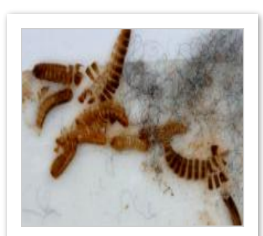
Attagenus larvae and cast skins on trap