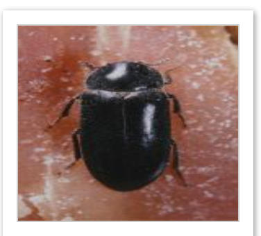
Hide or leather beetle Dermestes maculatus