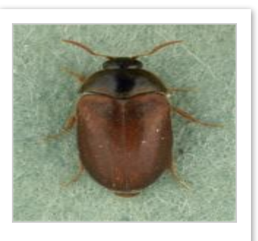
Brown carpet beetle or Vodka beetle Attagenus smirnovi