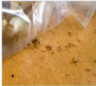
Trogloderma cast skins