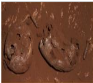
Trogloderma larva attacking slime mould specimen