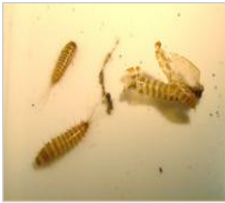
Trogloderma angustum larvae and cast skin