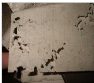
Silverfish damage to paper