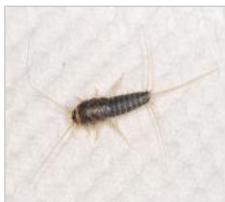
Grey silverfish Ctenolepisma longicaudatum