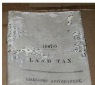
Silverfish grazing damage