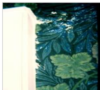
Wallpaper damaged by silverfish