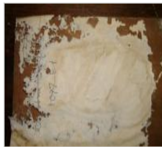
Silverfish damage inside book