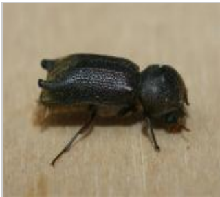
Oriental wood borer Heterobostrychus aequilus