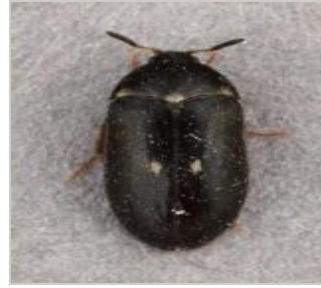
Two-spot carpet beetle Attagenus pello