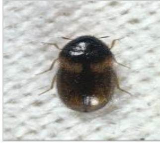
Museum nuisance beetle Reesa vespulae