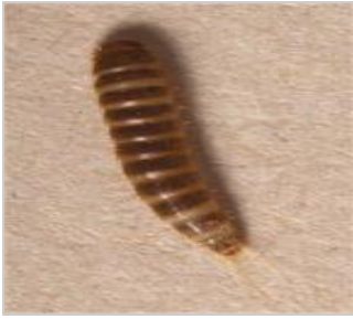
Brown carpet beetle or Vodka beetle larva Attagenus smirnovi