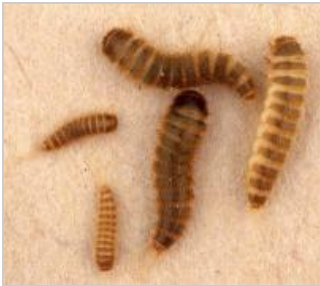
Vodka beetle larvae Attagenus smirnovi