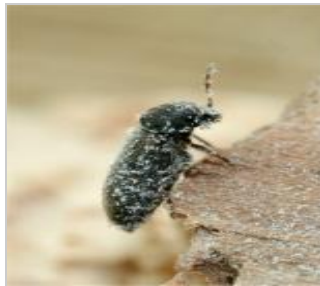
Woodworm / Furniture beetle Anobium punctatum