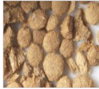
Death watch beetle frass