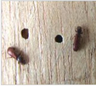
Powder post beetle and emergence holes