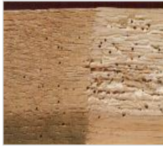
Powder post beetle damage