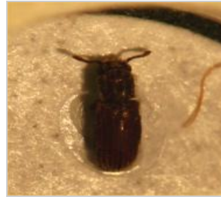
Powder post beetle Minthea sp