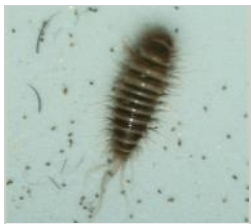
Anthrenocerus australis larva