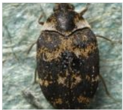
Dark carpet beetle Anthrenus fuscus