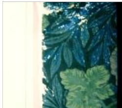
Wallpaper damaged by silverfish