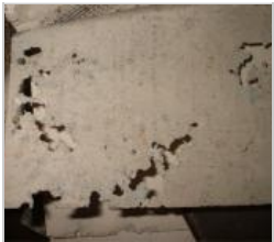
Silverfish damage to paper