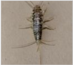
Firebrat Thermobia domestica