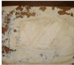
Silverfish damage inside book