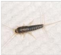
Grey silverfish Ctenolepisma longicaudatum