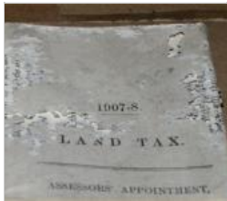
Silverfish grazing damage