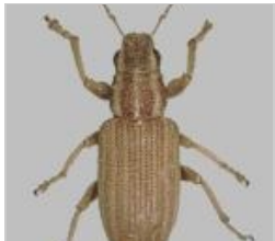
Clover weevil Sitona lineatus