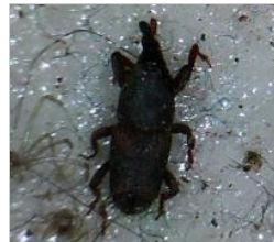
Rice weevil Sitophilus oryzae