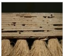
Wood weevil damage