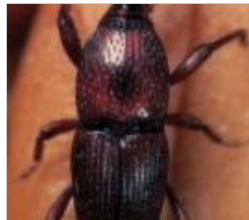
Grain weevil Sitophilus granarius