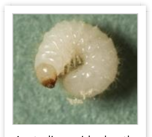
Australian spider beetle larva Ptinus tectus