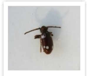
Six spot spider beetle Ptinus sexpunctatus