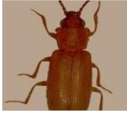
Fungus beetle Cryptophagus acutangulus