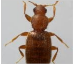
Fungus beetle Corticaria sp