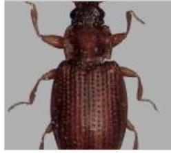
Plaster beetle Enicmus fungicola