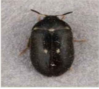
Two-spot carpet beetle Attagenus pello