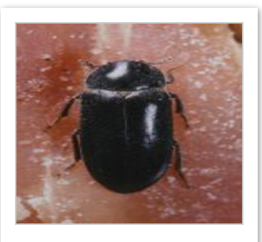
Hide or leather beetle Dermestes maculatus