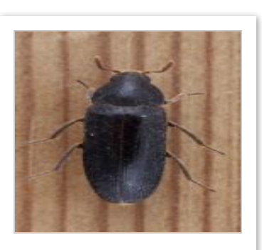
Peruvian Hide beetle Dermestes peruvianus