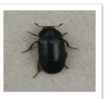
Hide beetle Dermestes haemorrhoidalis