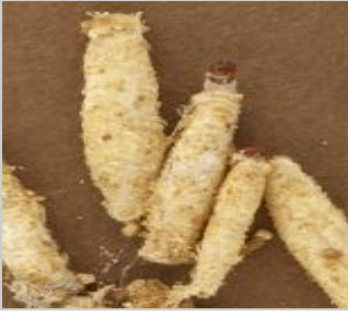
Case bearing clothes moth larvae and cases