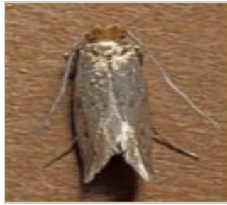
Case-bearing clothes moth Tinea pellionella