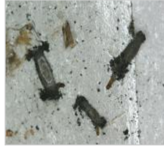
Case-bearing clothes moth cases on trap