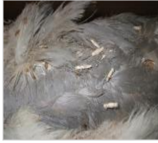
Case-bearing clothes moth cases on feathers