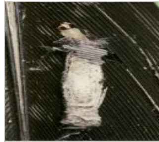
Case-bearing clothes moth Tinea pellionella larva in case