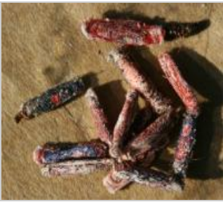
Case-bearing clothes moth cases Tinea pellionella