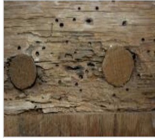
Death watch beetle emergence holes