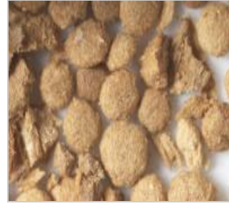
Death watch beetle frass