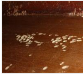
Spider beetle damage to shelf