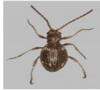
White marked spider beetle Ptinus fur