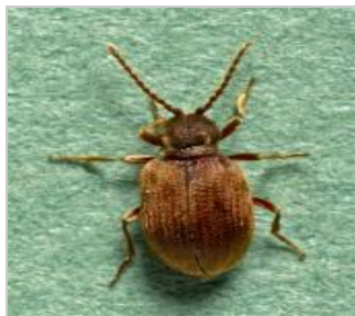
Australian spider beetle Ptinus tectus