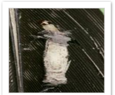
Case-bearing clothes moth Tinea pellionella larva in case