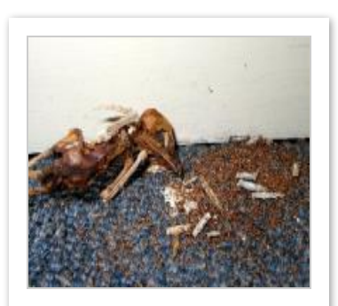
Case-bearing clothes moth cases on dead bird