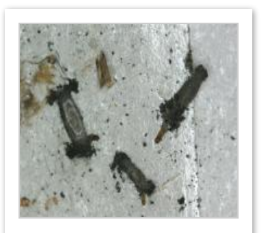
Case-bearing clothes moth cases on trap