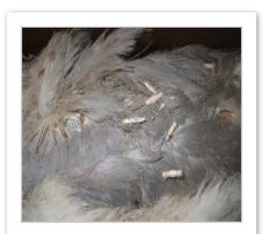
Case-bearing clothes moth cases on feathers