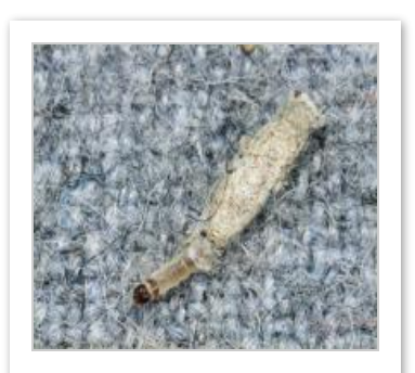
Case-bearing clothes moth larva Tinea pellionella