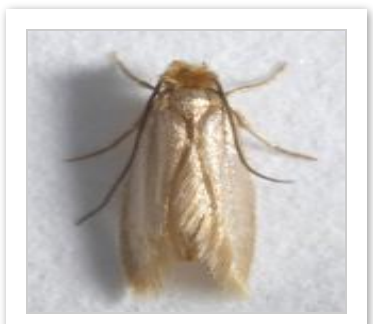
Common or webbing clothes moth Tineola bisselliella